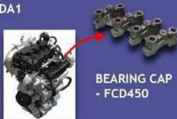
BEARING CAP - FCD450