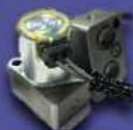
EPC20S VALVE 2021年立上げ予定